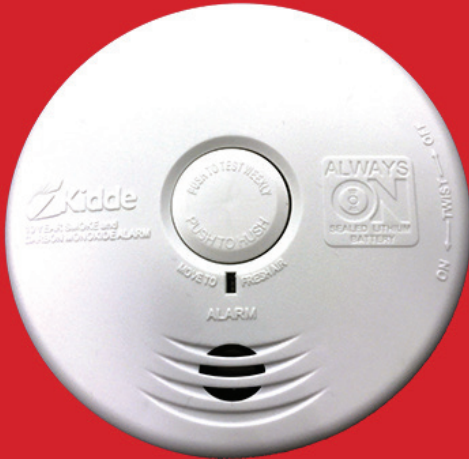
Alarm with sealed 10-year battery.